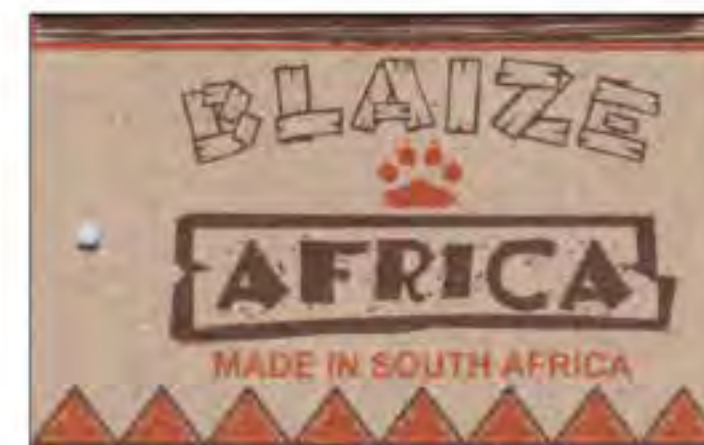
SWINGTAG 8cm x 5cm