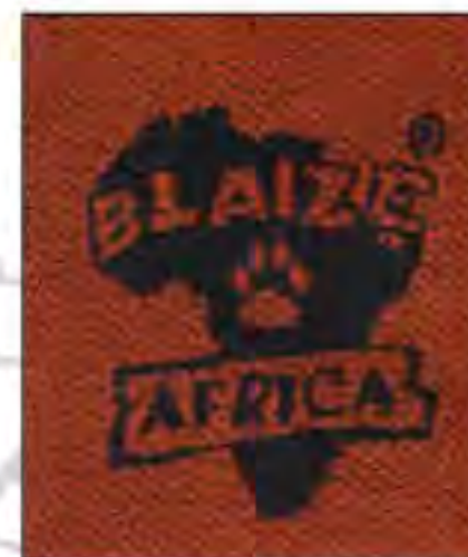
BACK NECK LABEL 3cm x 3.5cm