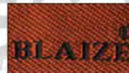
SIDE WINDER 3CM X 2CM