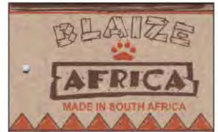
SWINGTAG 8cm x 5cm