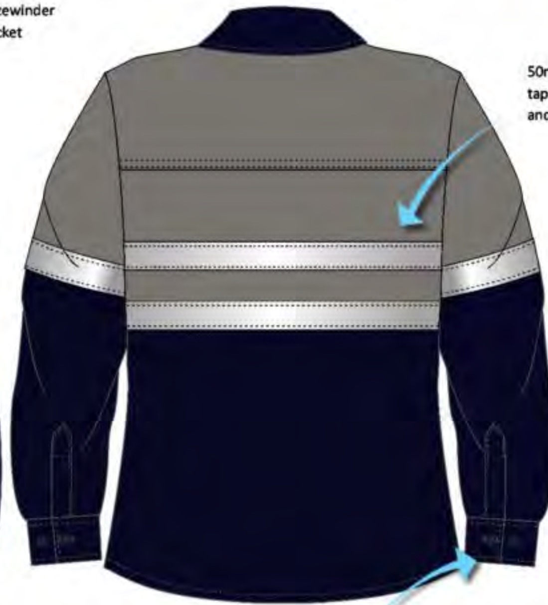
50mm reflective tape on front back and sleeves