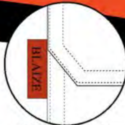
BLAIZE branded sizewinder on chest patch pocket