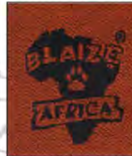
BACK NECK LABEL 3cm x 3.5cm